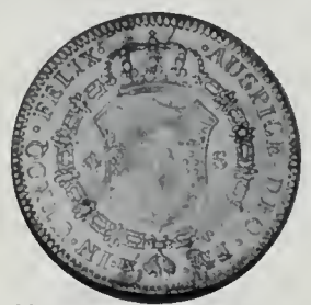
Lot No. 2367